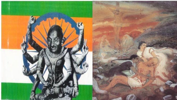
Reverence for Gandhi